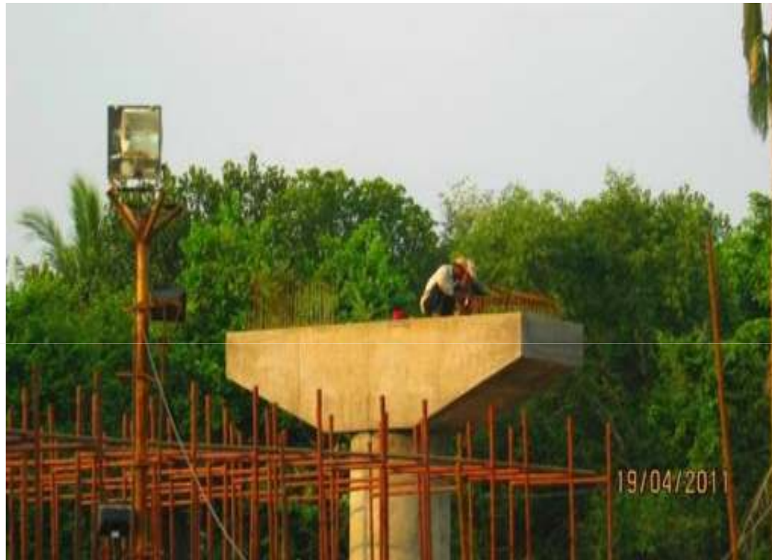
Reinforcement work for pedestal - 19.04.2011